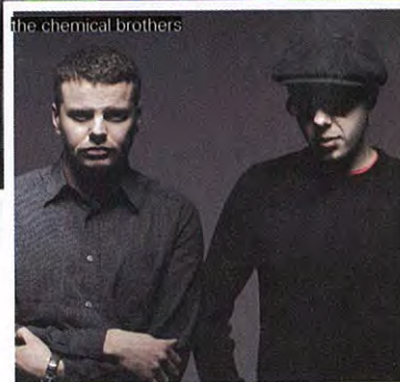
the chemical brothers