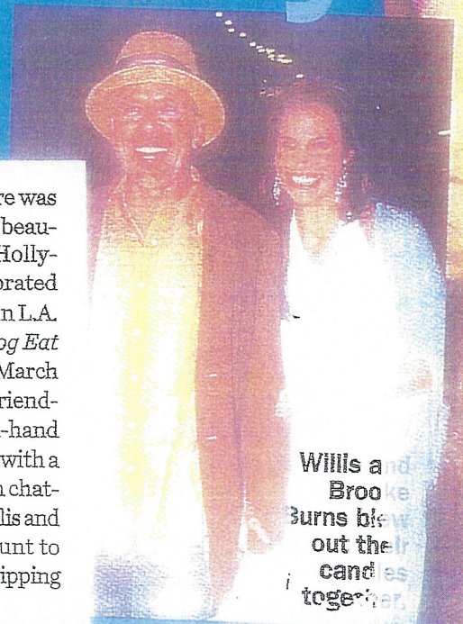
Willis and Burns blew out their candles together.

T here was cake, there was singing, there was Jack Nicholson surrounded by young beauties. In short, it was your standard Hollywood birthday bash as Bruce Willis celebrated hitting 49 a week early at the Spider Club in L.A. on March 12 with his girlfriend, former Dog Eat Dog host Brooke Burns, who turned 26 on March 16. Standard, that is, except for the extra-friendly exes: Demi Moore, who arrived hand-in-hand with beau Ashton Kutcher, greeted Willis with a kiss on each cheek, while Melanie Griffith chatted with ex Don Johnson. Next stop for Willis and Burns? The ultimate birthday gift: a jaunt to Paris, where they turned up four days later sipping coffee near the Champs-Élysées.