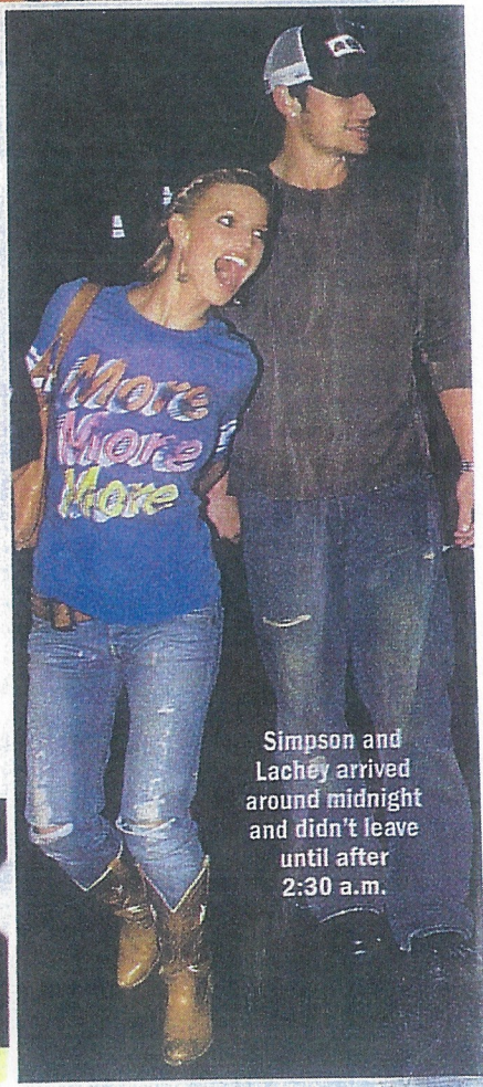
Simpson and Lachey arrived around midnight and didn't leave until after 2:30 a.m.